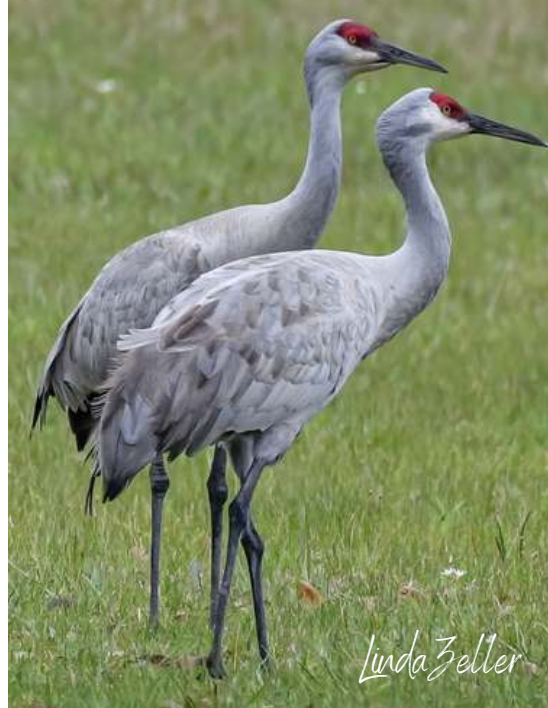
Sand Hill Cranes