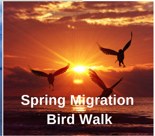
Spring Migration Bird Walk