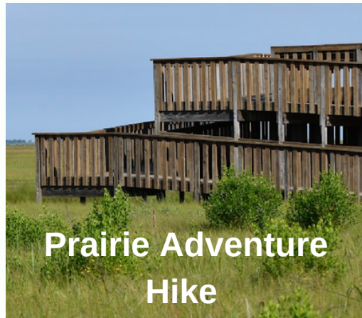
Prairie Adventure Hike